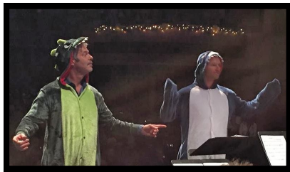
Dragon and Shark 2015 Hallelujah Chorus Winning Conductors

A new tradition at Holiday Magic was created in 2014, where an audience member, for a donation of $20, can enter an individual's name in a drawing to conduct the Hallelujah Chorus as the finale of our concert. This tradition has proven to be quite successful and extraordinarily entertaining, as seen below.